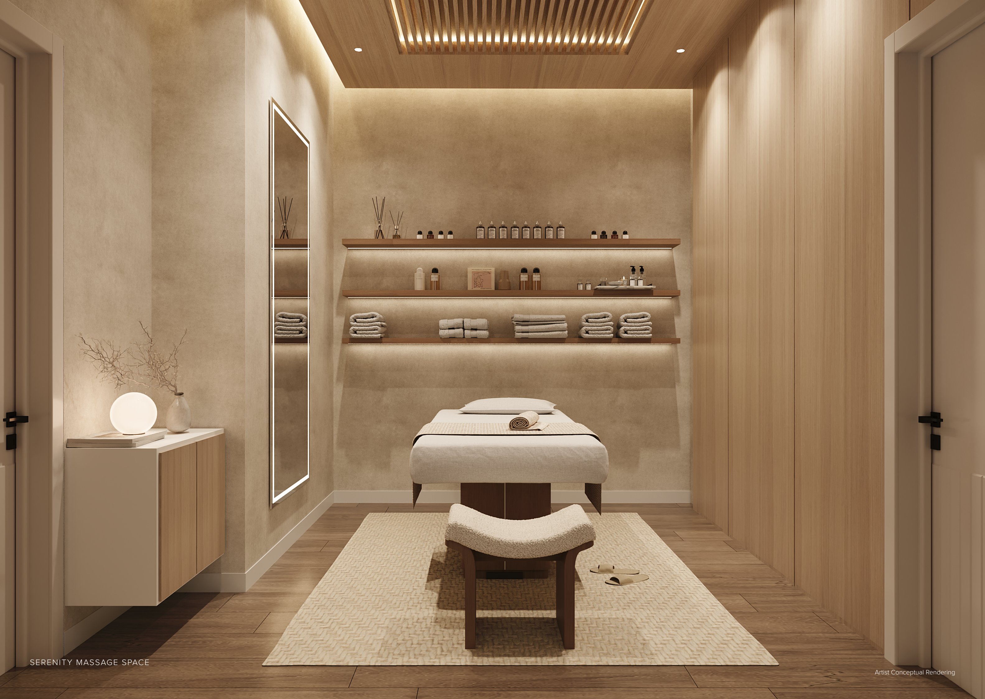
SERENITY MASSAGE SPACE